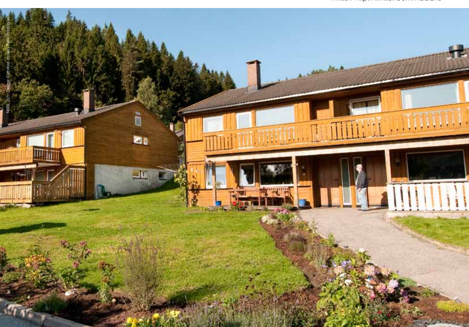
The housing co-operative Wergelandsveien in Kristiansand is converted into low-energy housing.

Internett: http://www.nbbl.no Twitter: http://twitter.Com/NBBLno