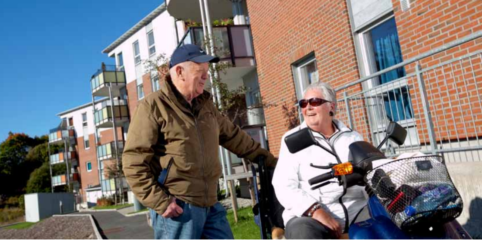
Outdoor recreation in the Nordbyhagen housing co-operative. Vestby.